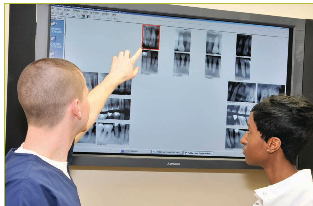
Dental hygienist students learn to perform and evaluate x-rays.