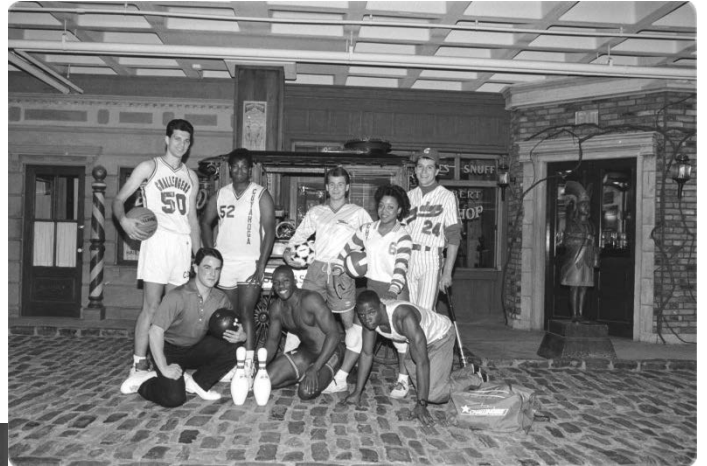
Athletic Brothers 1990