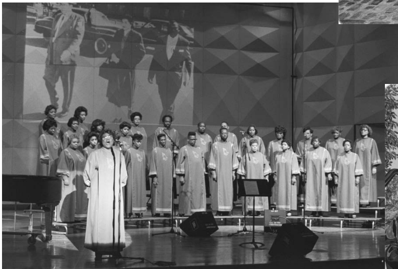
Martin Luther King Day Celebration 1990