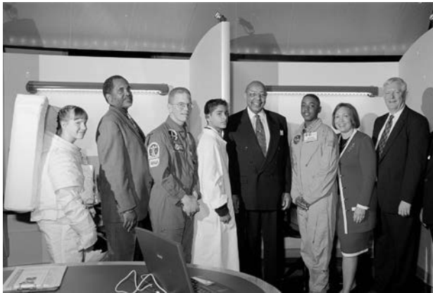
Science Engineering & Aerospace Academy (SEMAA) Dedication 1999