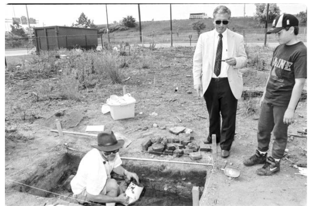
Anthropology Day 1995