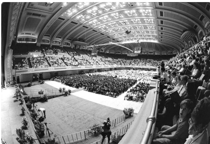
Commencement Metro 1990