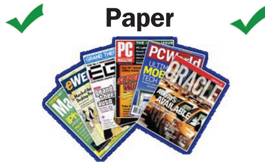
Magazines and Catalogs